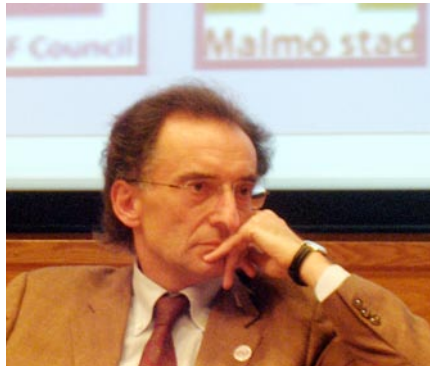
Jean Louis de Brouwer from the European Commission's DG Justice, Freedom and Security

The Green Paper will aim to spark a discussion among all relevant stakeholders who will also be invited to submit their opinions. The consultation process will culminate in a hearing in Brussels on 18 October and inform the preparation of