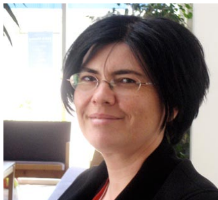
Muriel Guin from the European Commission.