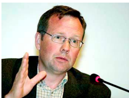
Kent Andersson, Mayor of Malmö the host of the conference, called for more co-operation directly between cities of Europe.

It was an impressive line-up of Commission officials from two directorates and a former Commissioner in the first plenary debate. Moreover the leader of the City Council of Malmö.